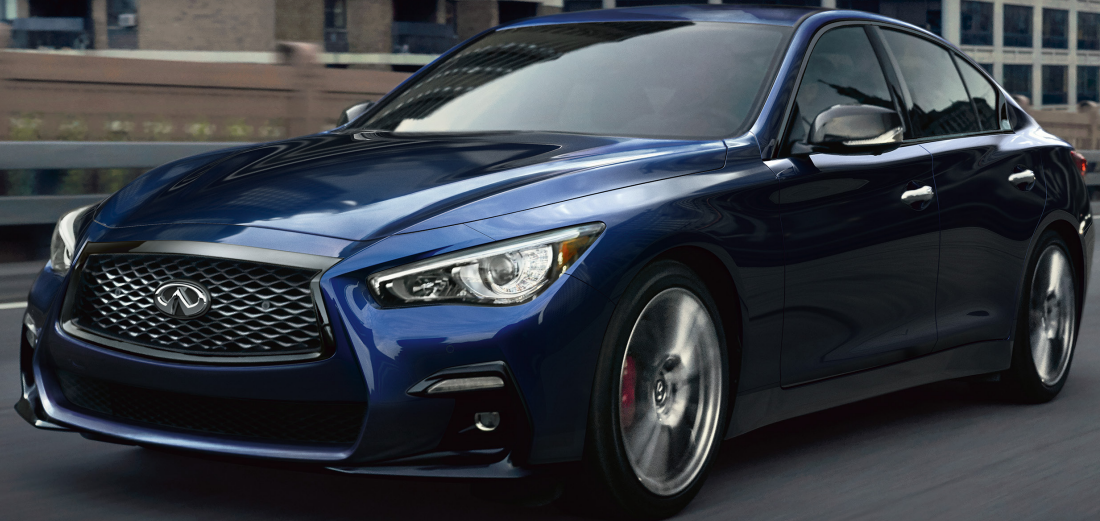
U.S. model shown.