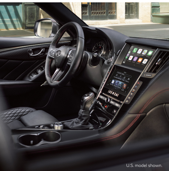
U.S. model shown.